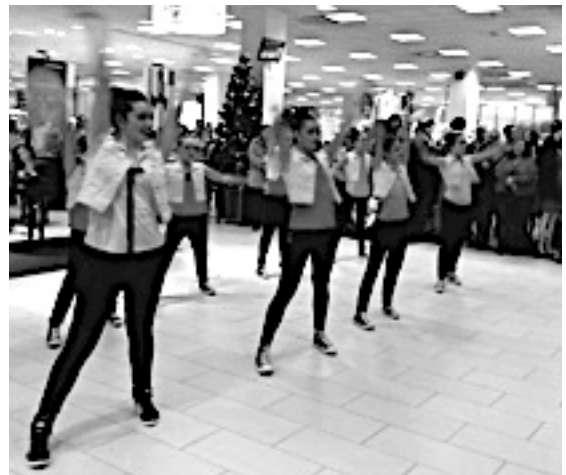
IN.MOTION dancers have also participated in The Bay Show, a breast cancer awareness event (above), Ballet Jorgen's "The Nutcracker", and KW Musical Production's "Anne of Green Gables".