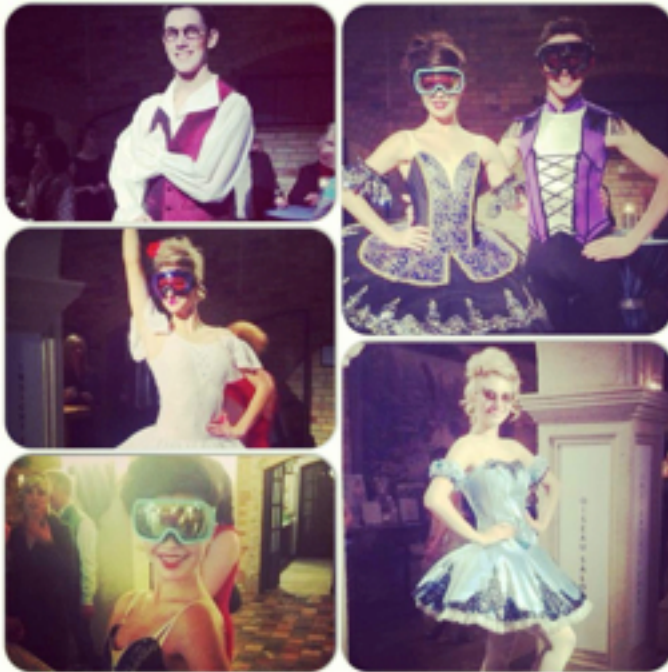
IN.MOTION dancers at the Winter Wonderland Event in support of St. Mary's Hospital